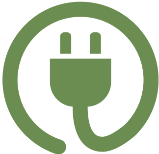
Operating during Loadshedding