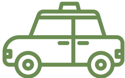
Transfers available on request